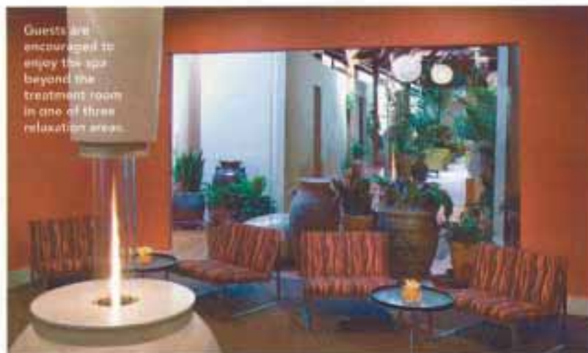
Guests are encouraged to enjoy the spa beyond the treatment room in one of three relaxation areas.